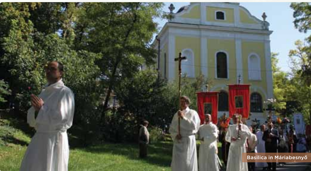
Basilica in Máriabesnyő

Baroque church and Virgin Mary Statue, located in the beautifully situated Máriabesnyő attract thousands of pilgrims every year.