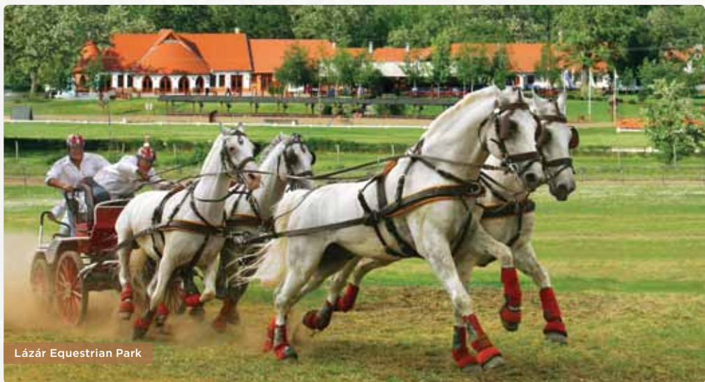
Lázár Equestrian Park

Visitors can learn about equestrian traditions during spectacular performances of carriage driving, horseback archery, the acrobatics of the horseherders and hussars. These dramatic equestrian shows evoke the period of Queen Elis-