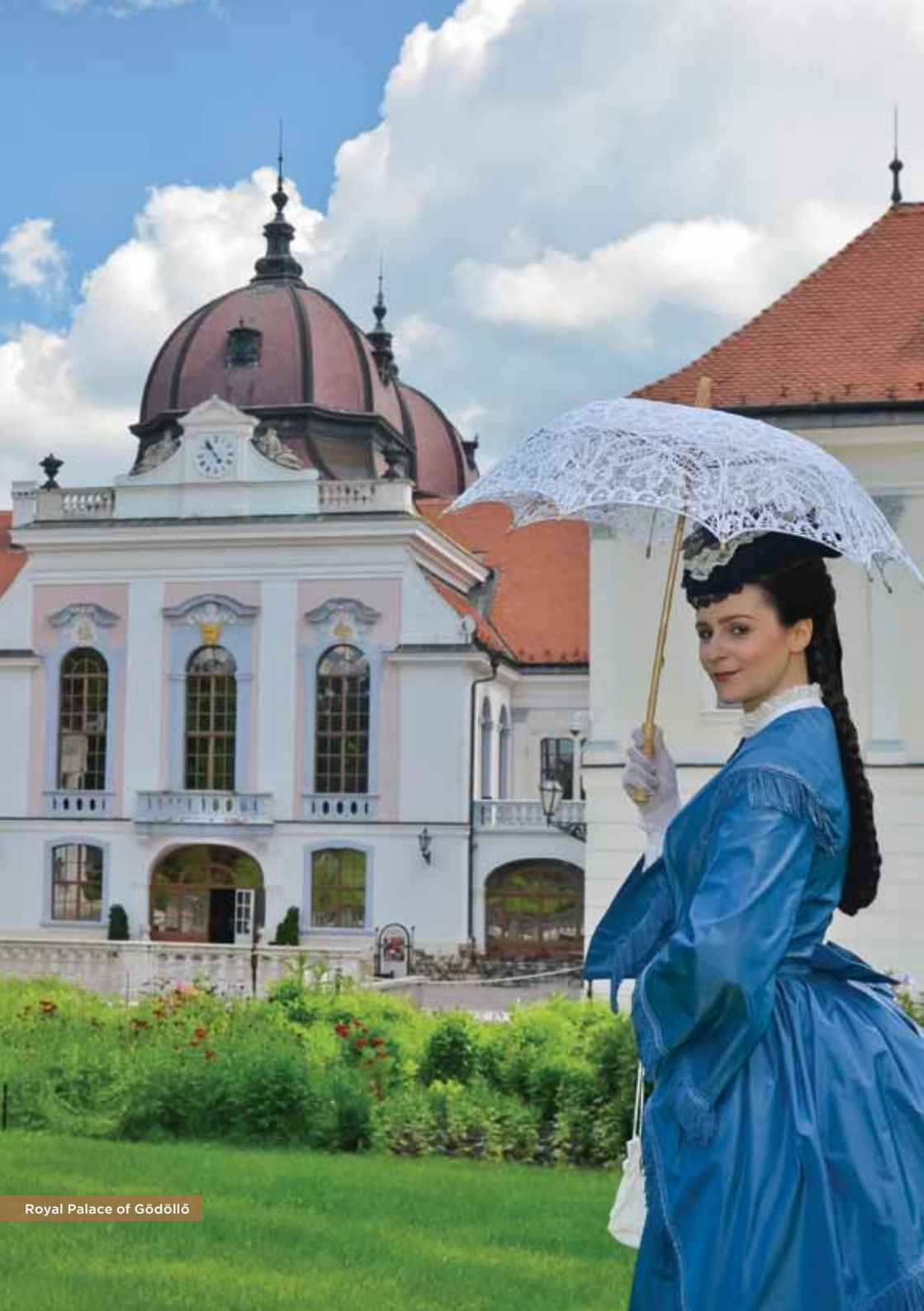
Royal Palace of Gödöllő