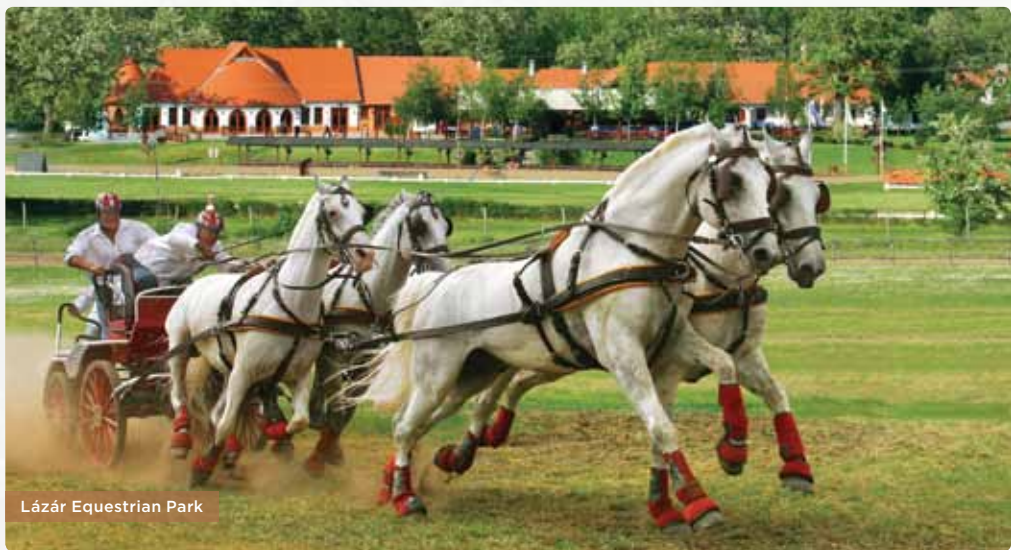
Lázár Equestrian Park

Visitors can learn about equestrian traditions during spectacular performances of carriage driving, horseback archery, the acrobatics of the horseherders and hussars. These dramatic equestrian shows evoke the period of Queen Elis-